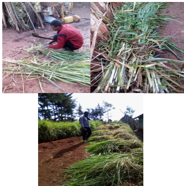
Figure 2: Cut and carrying and chopping of feed practiced by Derashe farmers.

of Wolaita Zone for dairy cattle feeding systems (free grazing, rotational-grazing and zero-grazing). Overall in the study area, there was poor management of grazing-land, only 6.7% of respondent uses manure application, 9.7% practices weeding, and 19.5% did not apply any management activities to grazing-lands. The current finding is contradicted to the finding reported by [50] which indicated that (14.8%) households apply fertilizer, (51.8%) households apply cattle manure on grazing-lands, and only 22.5% of the respondents manage their pasture-land, while the majority (77.5%) did not manage their pasture-land in central highlands of Ethiopia.