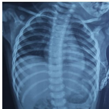
Figure 4: (i) LLZ Peripheral opacity (ii) case of chest trauma With ICD tube insitu with minimal GGO LMZ.