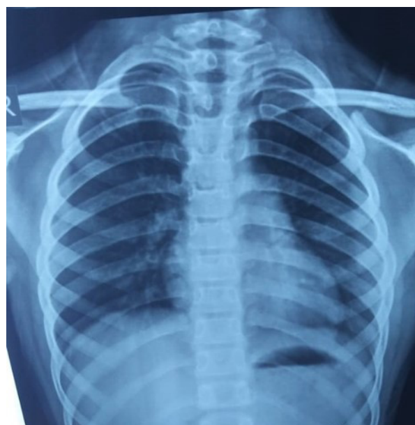
Figure 2: GGO, LMZ& LLZ extending to Periphery.