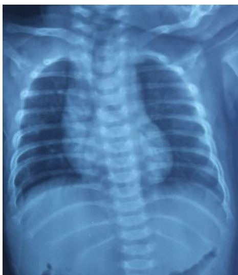
Figure 3: GGO LMZ

In one child moderate involvement of both lungs noted, who is suffering from AML. No severe involvement case found in this study.