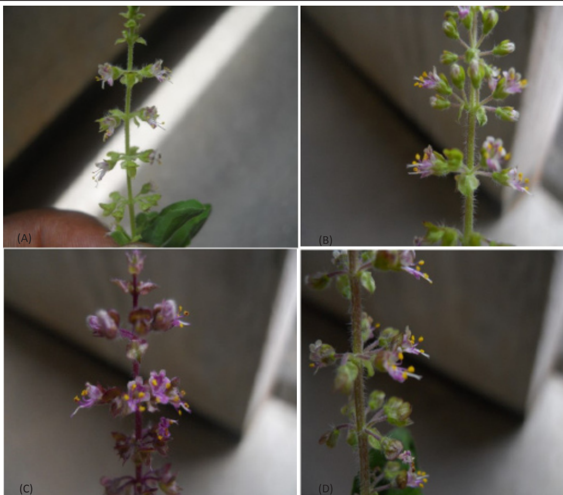
Figure 1: Inflorescence of Ocimum tenuiflorum morphotypes