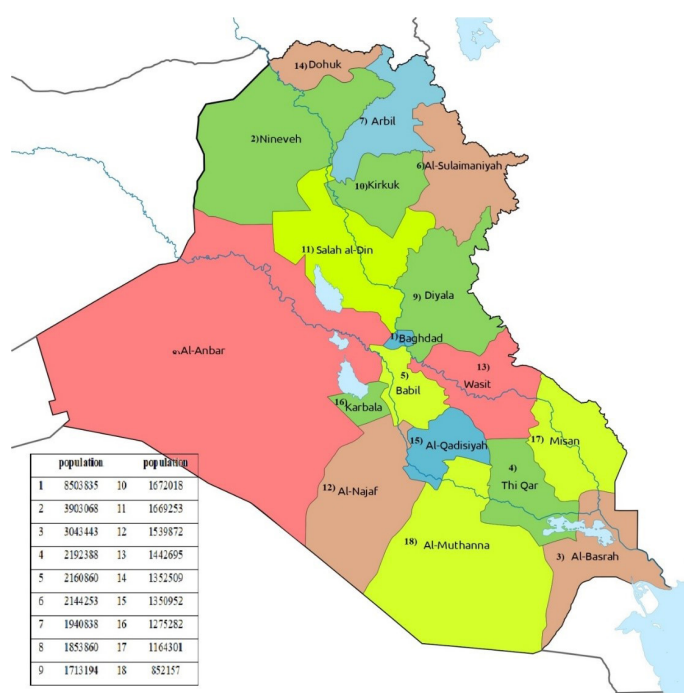
Figure 1: Map of Iraqi Governorates by population, 2020.

The current study estimated incidence of COVID-19 according to its definition, number of NEW cases during a given period among population at risk during that period [11]. Included cases were infected patients with COVID-19 whose PCR test was positive. Cases with negative PCR were excluded from the equation of incidence calculation even if they were diagnosed on clinical or radiological base. Denominator of the equation was Population of Iraq in general and of each governorates in particular during the year 2020. It was derived from statistics of 2018 census and latest official estimates and projections that were published by the Report of Central Statistical Organization in Iraqi Ministry of Planning [12] (Figure 1).