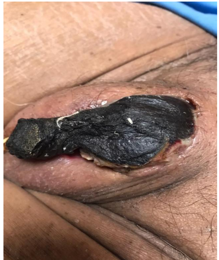
Figure 1: Gangrenous dorsal penis.

Penile calciphylaxis is an extremely rare disease. It affects the penis by the build-up of intimal fibrosis and medial calcifications of the small arteries and causing gangrene of the tissue. It is frequently seen in patients with uncontrolled diabetes and end stage renal failure. Penile calciphylaxis has a poor prognosis and carries a high mortality rate about 64%. Unlike Fournier's gangrene, wound debridement is controversial in penile calciphylaxis. We would like to report a case of a 66-year-old man with a long history of uncontrolled type-2 diabetes whom presented with penile calciphylaxis at our center. He ends up with a penile auto-amputation despite received intravenous antibiotics and wound debridement. Early intervention such as aggressive wound debridement may prevent the patient from succumb into septicemia and death.