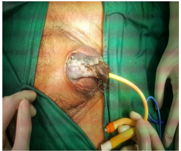
Figure 3: Ventral penis after wound debridement.