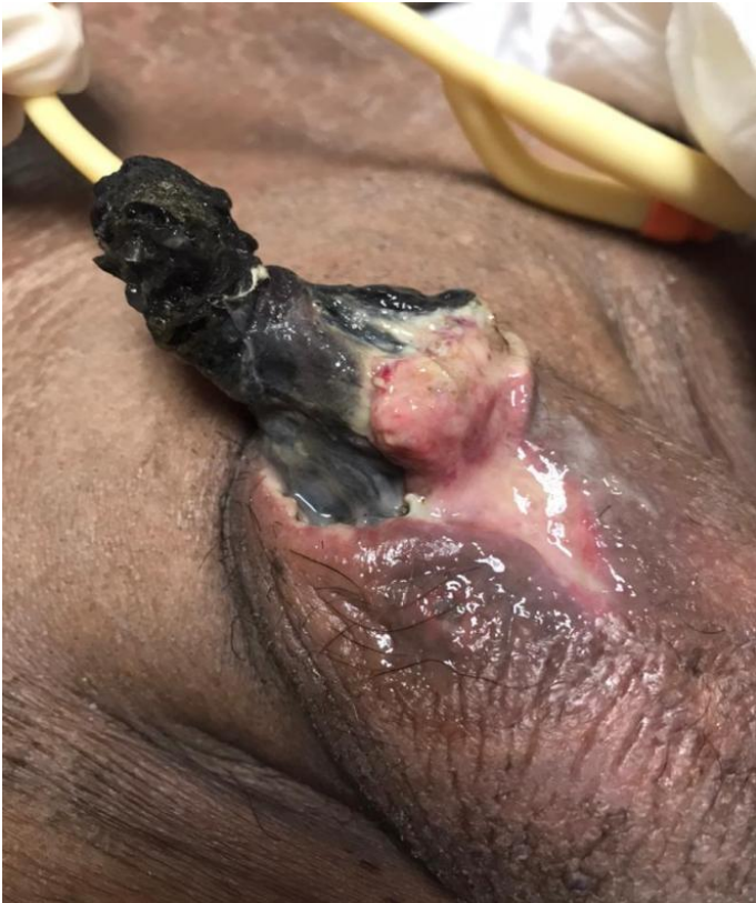
Figure 2: Gangrenous ventral penis.