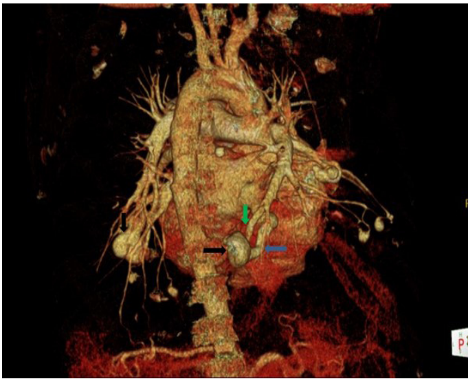
Figure 1: Anatomoscanographic section of pulmonary arteriovenous malformations.