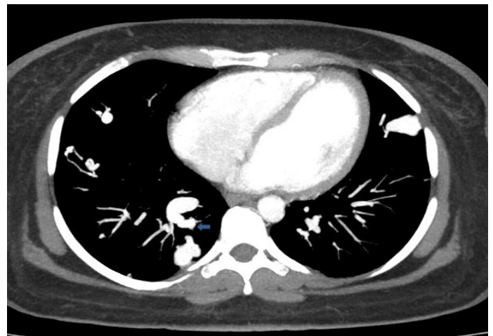
Figure 3: Axial CT scan with contrast medium showing multiple aneurysmal sacs in both lung fields.