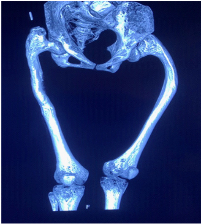
Figure 1: Bilateral femur deformity on CT, especially in the left side.