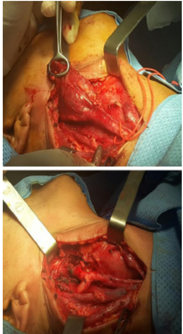
Figure 3: Peroperative images shows close relationship of the paraganglioma with the jugulo-carotid axis.

We performed a large cervicotomy with resection of the paraganglioma with a very delicate dissection of the jugulo-carotid axis as shown in the Peroperative images.