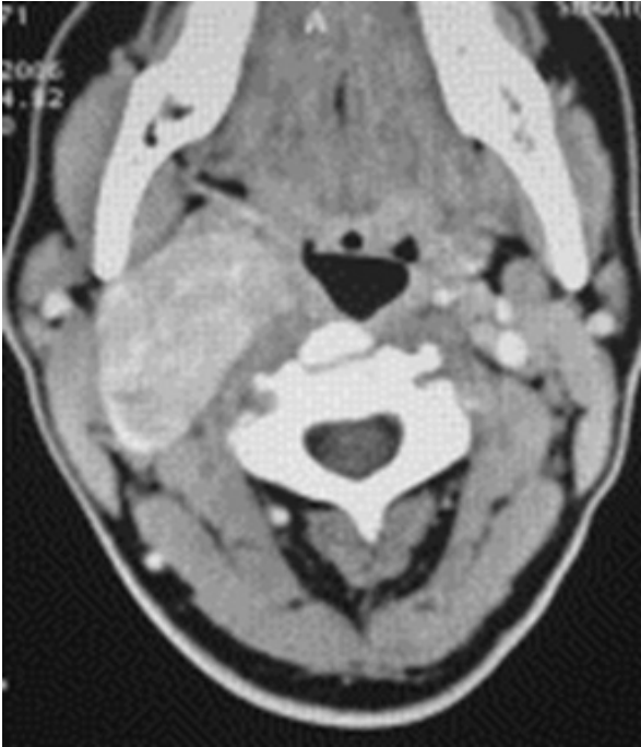
Figure 1: Cervical tomodensitometrie.

An arteriography revealed a vascular blush with a very rapid contrast wash.