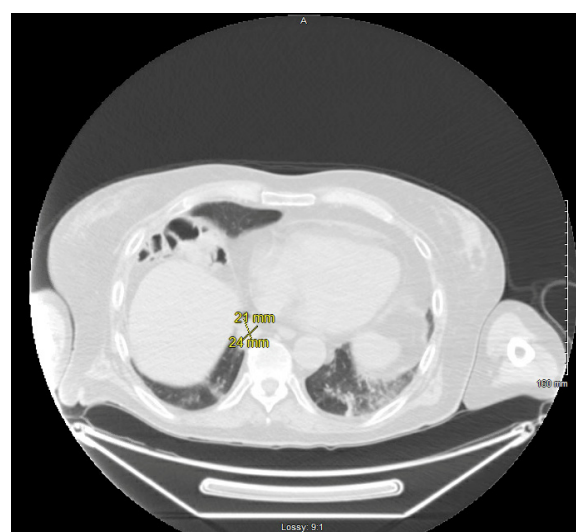
Figure 2: PET CT scan demonstrating significant interval decrease in size and hypermetabolic activity after two doses of pembrolizumab.