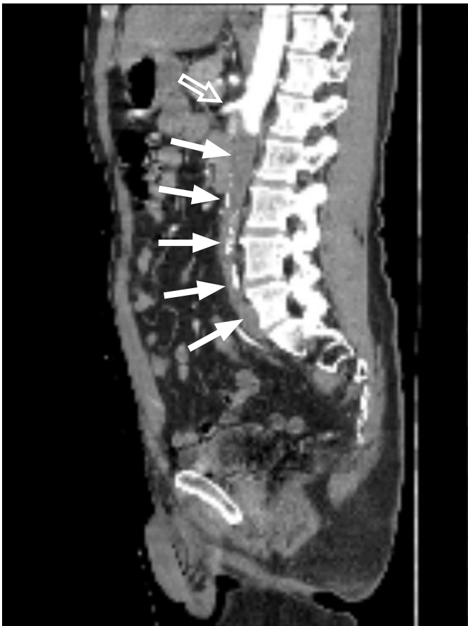
Figure 1: Sagittal view. Occlusion of the infra-renal abdominal aorta (solid arrows). Superior mesenteric artery (hollow arrow).