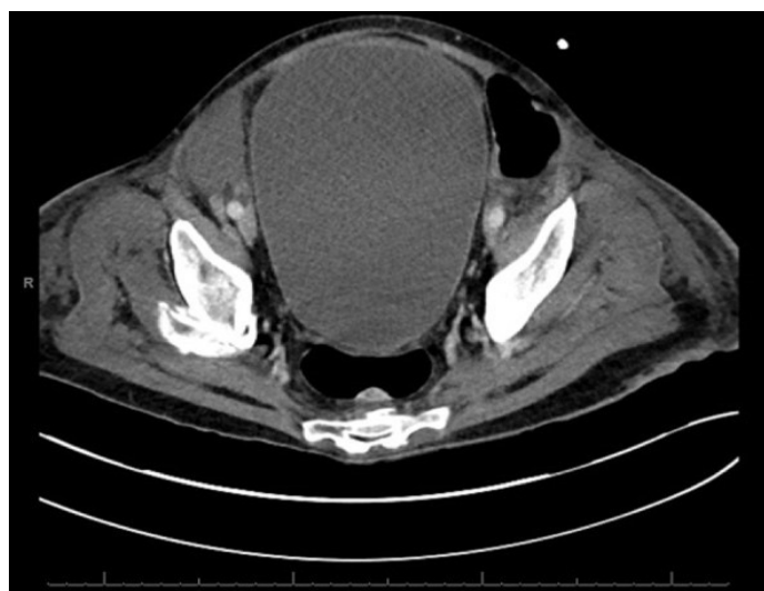
Figure 1b: CT image demonstrating a grossly distended bladder in-keeping with a poorly inserted and non-draining catheter. The large bladder compressed the distal sigmoid colon, slowing transit.