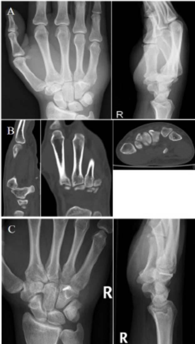
Figure 3: Radiographic images of case 2 – A. Radiographs after trauma showing dislocation of CMC four and five with a bone fragment on the dorsal side of the carpalia. B. Computed Tomography showing a dorsal fracture of the hamate with dislocation of CMC four and five. C. Radiographs after open reduction and internal fixation, the hamate was reconstructed and fixated with one screw.

after a couple of days, using the same dorsal approach as in the previous cases. After the hamate was reconstructed and fixated with one screw, a stable CMC joint was obtained (Figure 4). Hand therapy was started after three weeks of cast immobilization. Six weeks after surgery, the range of motion of the digits was similar to the contralateral side and radiographic images showed an anatomical osteo-articular ratio (figure 3C). After 12 weeks normal life routine was resumed.