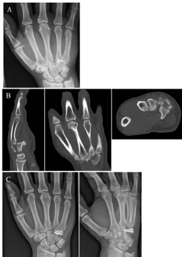
Figure 2: Radiographic images of case 2 – A. Radiographs after trauma showing dislocation of CMC four and five. B. Computed Tomography showing a longitudinal fracture of the hamate with dislocation of CMC four and five. C. Radiographs after open reduction and internal fixation, the hamate was reconstructed with a plate screws.

The second case concerns a 40-year-old male with pain and swelling at the base of his right fourth and fifth CMC joint after he fell down the stairs and hit the wall with his right fist. Conventional radiographic images showed a dislocation of CMC four and five (Figure 2A), additional computed tomography showed a longitudinal fracture of the hamate with dislocation of CMC four and five (Figure 2B). We performed open reduction and internal fixation that same day, using a dorsal approach at CMC 4-5. After reduction of CMC four and five, the hamate was reconstructed with a plate (Stryker Profyle Small Bone Plating System) and two screws, which resulted in a stable CMC joint. After four weeks of cast immobilization, hand therapy was started. Radiographic images six weeks after surgery, showed a normal osteo-articular ratio (Figure 2C). Physical examination showed a similar range of motion of the hand compared to the contralateral side. The patient was lost in follow-up after 6 weeks.