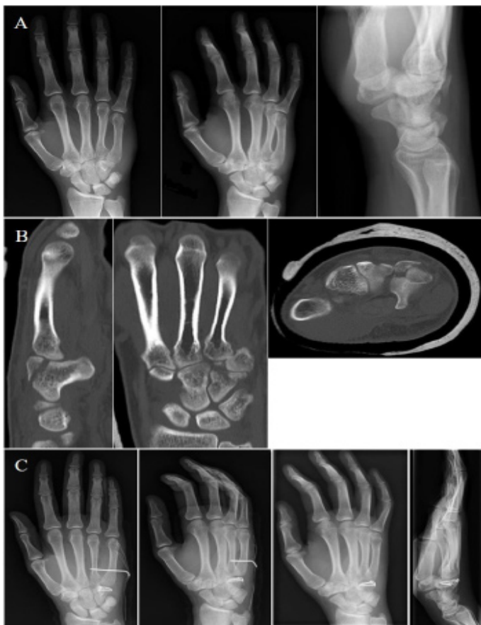
Figure 1: Radiographic images of case 1 – A. Radiographs after trauma showing dislocation of CMC four and five. B. Computed Tomography showing a comminutive fracture of the hamate with dislocation of CMC five into the core of the hamate. C. Radiographs after open reduction and internal fixation, CMC five was to transfixated CMC four and the comminutive fracture of the hamate was reconstructed and stabilized with a plate and screws.

A 23-year-old male presents himself at the emergency department with pain and swelling of the right fourth and fifth CMC joint after hitting a closet during a rage of anger. Conventional radiographic images showed a dislocation of CMC four and five (Figure 1A), additional computed tomography showed a comminutive fracture of the hamate with dislocation of CMC five into the core of the hamate (Figure 1B). After one week of cast immobilization to reduce the swelling, we performed open reduction and internal fixation. A dorsal approach at CMC 4-5 was used. After transfixating CMC five to CMC four, the comminutive fracture of the hamate was reconstructed and stabilized with a plate (Stryker Profyle Small Bone Plating System) and two screws. The CMC joint was reconstructed and felt stable. Post-operative radiographic images showed an anatomical reconstruction (Figure 1C). The transfixation of CMC four and five was removed after two weeks. After four weeks of cast immobilization, the patient started with hand therapy. Six weeks after surgery, the range of motion of the digits was similar to the contralateral side and radiographic images showed no post-traumatic abnormalities (Figure 1C). After 12 weeks normal life was resumed without residual symptoms.