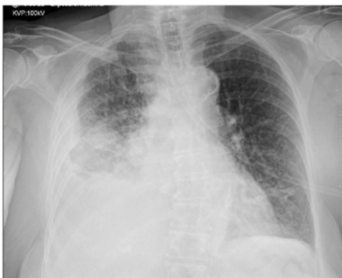
Figure 1: CXR on admission showing right pleural effusion and collapse.