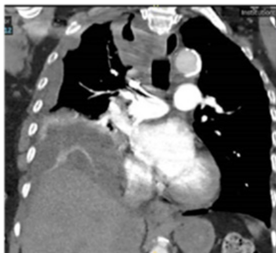
Figure 4: Sagittal view of CT Thorax