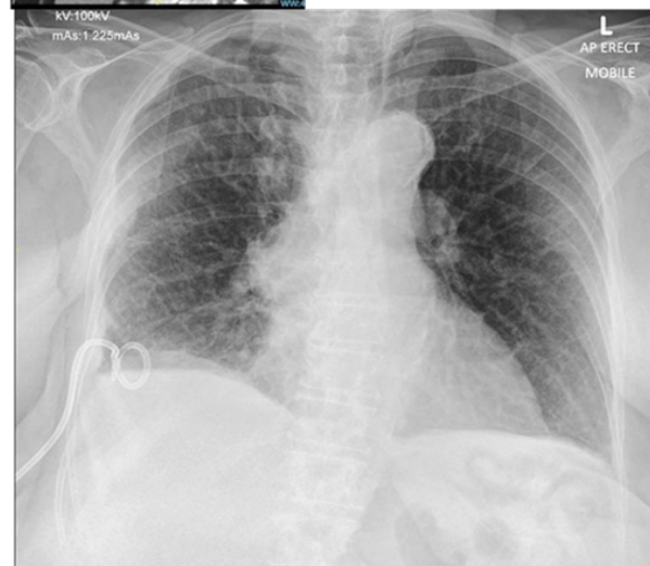
Figure 5: Right basal chest drain in situ, improvement of the right-sided pleural effusion, although right lower zone volume loss remains. Right-sided pleural thickening.