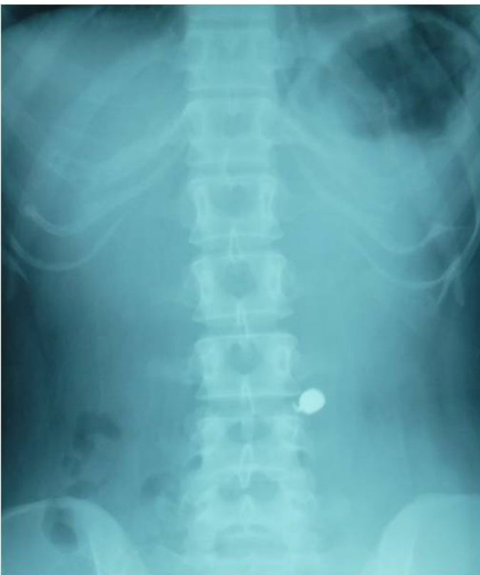
Figure 2: A crown with loop was observed.