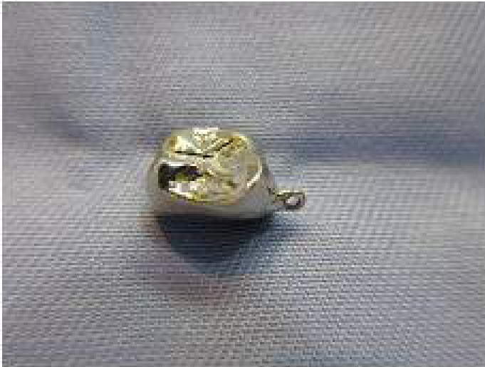
Figure 1: Abdominal X-ray imaging