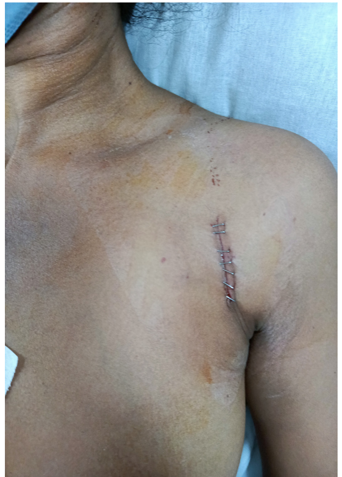
Figure 2: Post-operative picture showing the stapled suture line of the incision used for cephalic venous chemoport insertion.