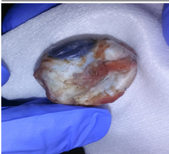
Figure 4: Hypotonic eye ball deprived from its conjunctiva and muscles.