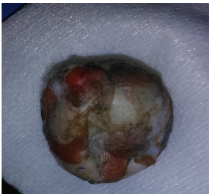
Figure 5: Optic nerve completely sectioned.