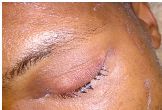
Figure 1: Slightly edematous left upper eyelid with small wound near the internal canthus.

A 38 year-old man former tourism sector dealer, father of 4 children sustained left oculo-palpebral injury. She had no history of familial conflict nor drug smoking. Being fed up of job loss, he reportedly has begun to drink the "Toaka gasy" since the beginning of lockdown in Madagascar, in March 2020. According to his family, he took at least 1 liter of Toaka Gasy a day and became to speak to himself. The patient could not remember the mechanism of the trauma that happened at night time. At admission, the patient is conscious with glasgow score of 15/15. On ophthalmologic examination, the right eye was normal with 20/20 vision. Visual acuity of the left eye was no light perception. The upper eyelid of left eye was slightly edematous and there was a small wound near the internal canthus (Figure 1).