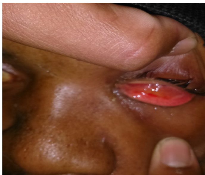
Figure 3: The conjunctiva is sutured.

Then we closed the conjunctiva with absorbable suture vicryl 6/0 (Figure 3).