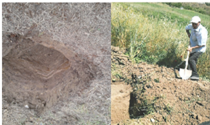
Figure 1: Field soil erosion studies.

From this point of view, in order to increase the efficiency of the research, the relevant research methodology was selected in accordance with the work plan, 1 ha of experimental area was selected in the Institute’s Support Station, located in Melham village of the region for field soil erosion research, agro-technical measures, including preparation of relevant fields have been carried out. For this purpose, the relevant research methodology was selected in accordance with the work plan, the relevant agro-technical measures, including the relevant agro-technical measures in the area of 1 ha, located in the territory of Melhem village of the region, in the Support Station of the institute. Relevant field leveling works were carried out.