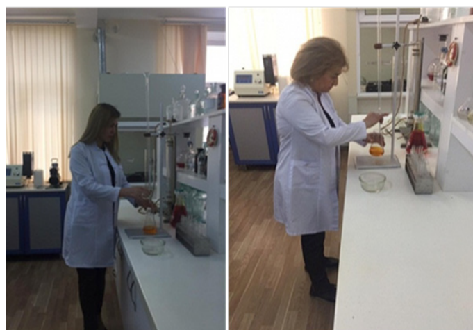
Figure 2: Laboratory analysis of soil samples.

The experimental area was selected according to the approved scheme in the area of the research object, where two experimental stationary flow sites were developed and installed for the purpose of conducting field soil-erosion researches in the field by developing an experimental scheme for studying surface flow and soil washing.