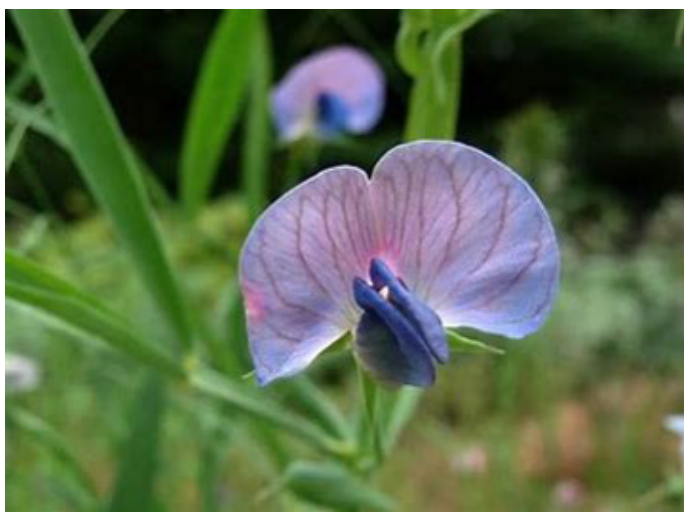
Figure 2: Grass pea, the misleading attractive plant.

The emerging disease was finally named as Lathyrism by Cantani in 1873 [1-5]. The toxin was chemically analysed and reproduced by Lambein et.al in Belgium, whilst trying to ameliorate the toxin. The plant was detoxified by C. Hunbury, (West Australian Agricultural Institute), where the scientist managed to release a toxin free legume into the wild and allow feeding of the poor. In India, in 2016, developed was a genetic variant of ODAP, a qualitative improvement, eventually leading to the eradication of Lathyrism in India [8-11].