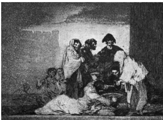
Figure 1: Francesco GOYA: "Thanks to Almorta"