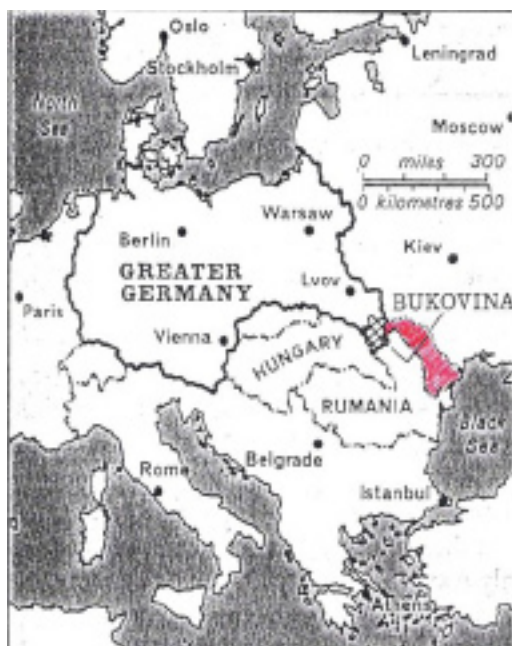
Figure 3: Map of Eastern Europe: In red the region of Transnistria.

It is the only example of forced nutrition with Lathyrus; this was noted in a population of Jewish prisoners interned in Transnistria, west of Ukraine, a geographical territory (between the rivers Burg and Dniester), offered by the Nazi regime to Romania as a reward for their collaboration in the anti-Soviet invasion and the anti-Jewish persecution during WWII [30].