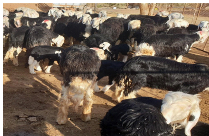
Figure 2: Najdi flock owned by a herd man located in the middle region (Al-Qassim) of Saudi Arabia.