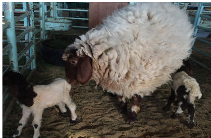
Figure 4: Noemi ewe delivered twin-lambs in the experimental station of Qassim University after exposed to CIDR-recombinant human FSH treatment of six descending doses.

(Controlled Internal Device Release; CIDR) led to the production of live twins in Noemi ewes (Figure 4). The ewes that were given saline (Control) gave birth of a single lamb (Figure 5). This experiment used the oral administration of L-arginine during the first trimester ( \approx 50 days) and date molasses during the last trimester ( \approx 50 days). The 90-days old weaning weight was 28.3 kg for the single lamb born of the control ewes; meanwhile, the same age weaning weight of each twin lamb was 28 kg (Table 1).