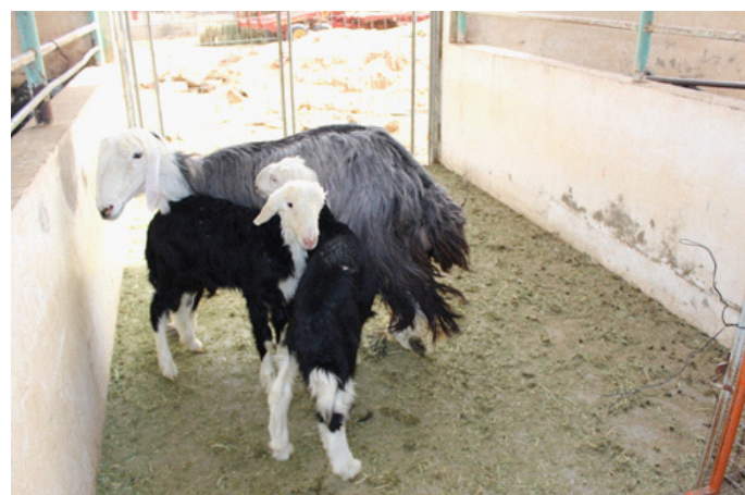
Figure 8: Najdi ewe delivered twin-lambs exposed to CIDR-recombinant human FSH treatment of six descending doses.