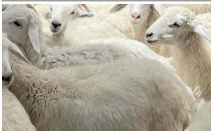
Figure 3: Harri sheep disseminated in the western region of the Kingdom.