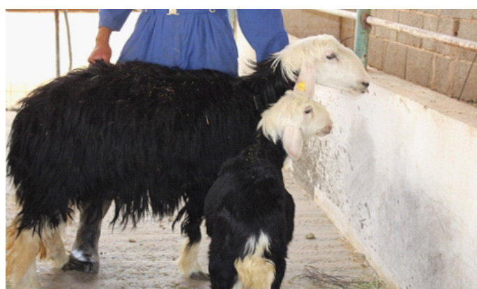
Figure 7: Najdi ewe given saline (Control) delivered a single lamb.

Giving the L-arginine concomitant with the twinning protocol for Najdi ewes resulted in healthy twin lambs (Figure 7) in a comparable size to the single-born control lamb (Figure 8).