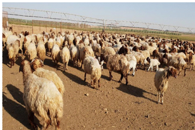
Figure 1: Noemi flock owned to a sheep raiser in middle region (Al-Qassim) of Saudi Arabia.