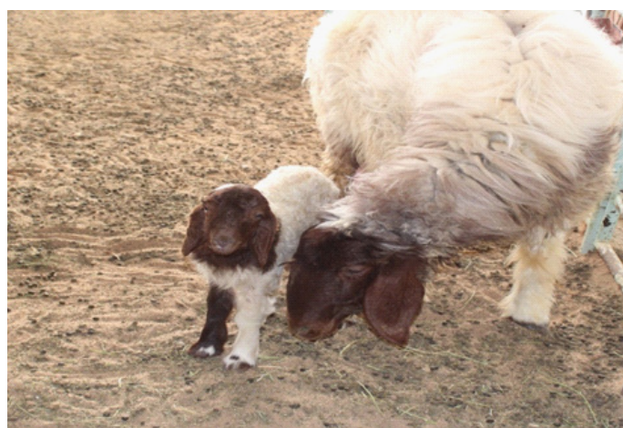
Figure 5: Noemi ewe given saline (Control) delivered a single lamb.