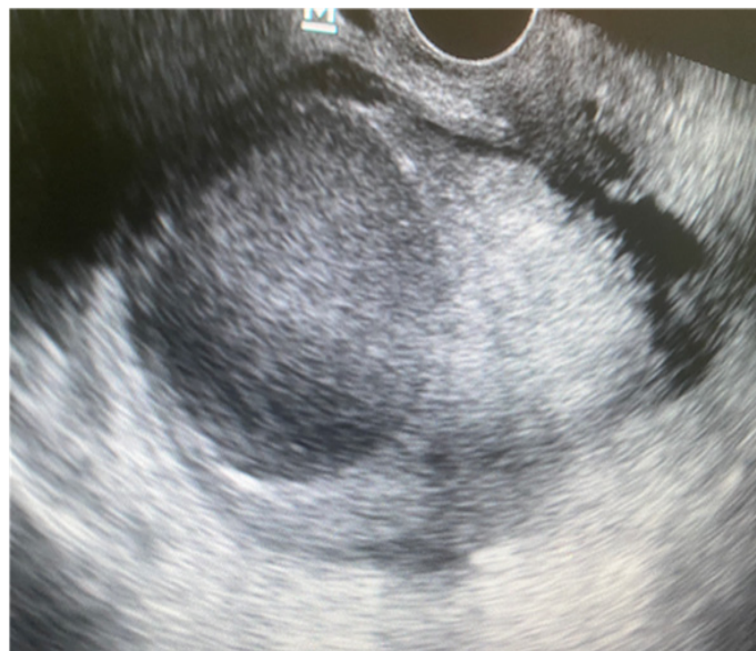
Figure 1: Ultrasound image of a 9 x 10 cm ovarian cyst with homogeneous content resembling an endometrioma with a ground glass appearance.

ger than usual and the enlarged ovary was twisted three times around her pedicle ( Figures 2&3 ). Using a syringe, a sample was drained from the chocolate-like content of the cyst. The right ovary was manually detorsed and an ovariopexy was performed. The patient was discharged after 5 days. She was immediately started on intravaginal progesterone (200 mg per day) for the two following months. At 38 weeks and 4 days, the patient had a vaginal delivery giving birth to a healthy boy weighing 3,2 kg.