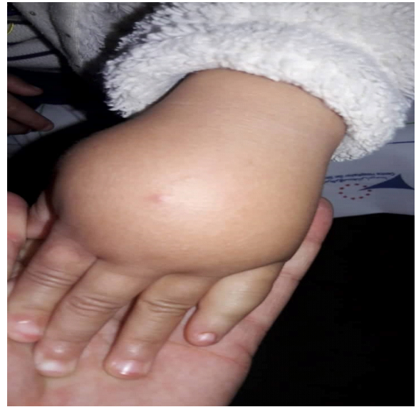
Figure 1: Aspect of lymphedema of the left hand.

The course was marked by the stabilization of his clinical condition.