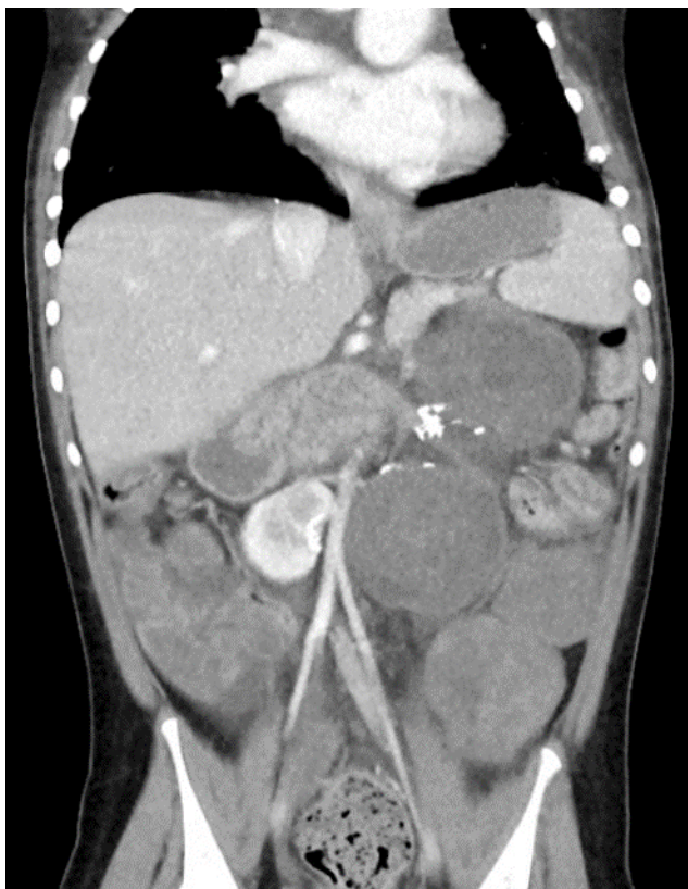
Figure 2: Wilms tumor relapse, with multiple abdominal masses (red arrows).