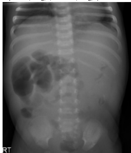
Figure 1: Plain abdominal X-ray showing most of the dilated gas-filled bowel loops located to the right side of the abdomen, typical of malrotation.

The patient recovered well, and feeding was reintroduced on day 4 post surgery. Full feeding was achieved without any vomiting or diarrhea, and TPN was stopped by day 8 post surgery. The serum albumin level increased from 18 g/L before surgery to 35-40 g/L from day 6 post surgery onward. She was discharged on day 16 post surgery. At the regular outpatient clinic review, she remained asymptomatic with excellent weight gain and growth. Repeat blood tests one week after discharge showed normal electrolyte and albumin levels: sodium, 136 mmol/L; potassium, 4.3 mmol/L; chloride, 102 mmol/L; urea, 4.8 mmol/L; creatinine, 45 \mu mol/L; HCO 3 , 22 mmol/L; base excess; total protein, 70 g/L; albumin, 40 g/L).