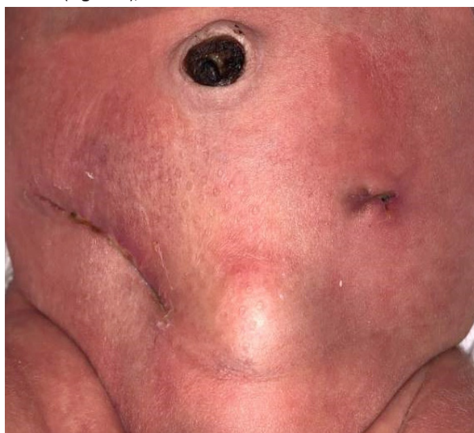
Figure 4: Anterior abdominal wall after closure of RLQ and LLQ defects.

bowel in the RLQ from the silo back into the abdominal cavity. On DOL6, he underwent a repeat exploratory laparotomy with final reduction and closure of his RLQ abdominal wall defect and placement of an incisional wound vac. Following the final closure ( Figure 4 ), antibiotics were discontinued.