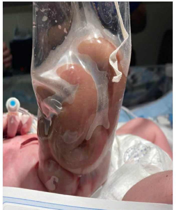
Figure 3: Surgically enlarged RLQ defect accommodating 5.5 silo.

The RLQ defect was surgically enlarged to accommodate a 5.5 silo in the RLQ ( Figure 3 ).