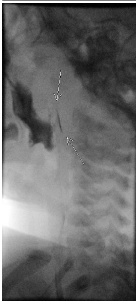
X-ray esophagram showing a small amount of contrast in the posterior pharyngeal wall and retropharyngeal soft tissues at the superior C1 level and inferior margin of the soft palate.