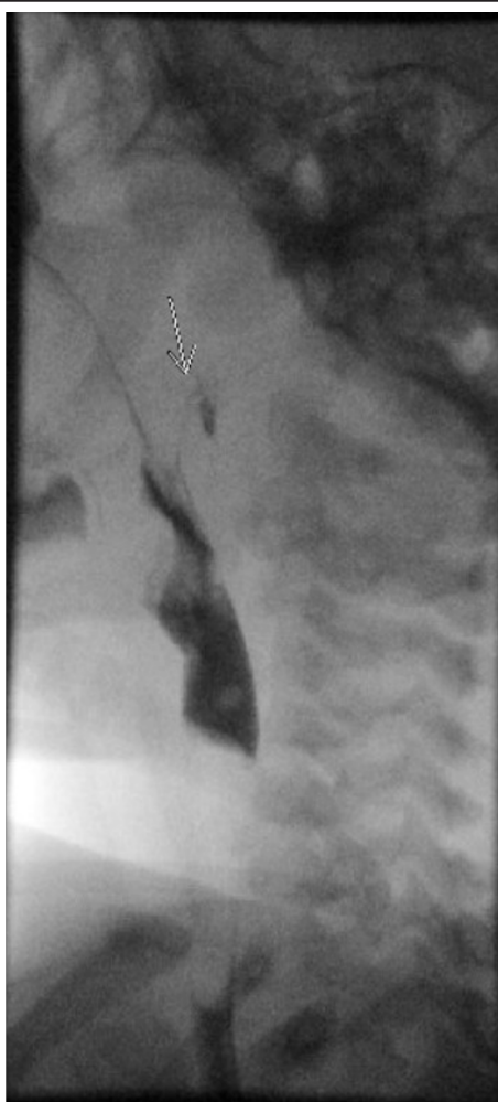
X-ray esophagram showing a small amount of contrast in the posterior pharyngeal wall and retropharyngeal soft tissues at the superior C1 level and inferior margin of the soft palate.