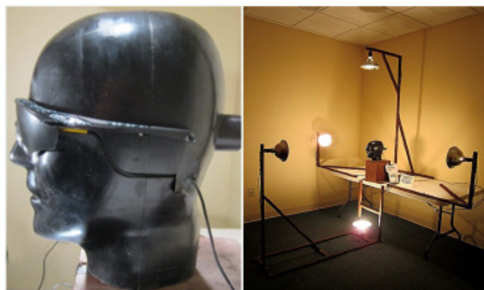
Figure 4: Frame coverage measurement from geometrically placed light sources

In a darkroom, and with all five light sources on, a baseline reading of visible light from the photometer was derived from the average of two measurements taken without sunglasses placed on the head form. The lenses of each pair of sunglasses to be tested were then opacified with black tape, cut precisely to the lens shape. The opacified sunglasses were then placed securely on the head form, with the temples resting on the two protruding metal stems located on each side where the tops of the ears would typically be. Three photometric measurements were taken with the opacified sunglasses in place and averaged. The average photometric measurement with the opacified sunglasses in place was then divided by the average baseline photometric measurement (with no sunglasses on). This determines the percentage of visible light that reaches the photometer by going around the sunglass lenses and frames.