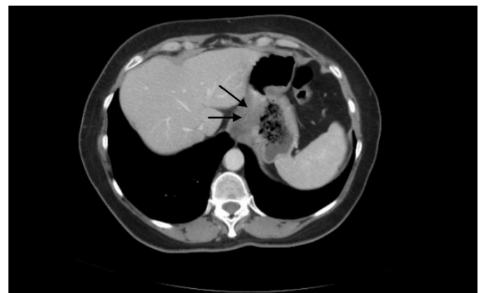
Figure 3 Top: Large gastroesophageal mass measuring 5.6 x 3.6 x 6.9 cm, extending from the distal esophagus into the lesser curvature of the stomach.