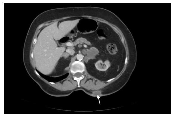
Figure 4 Bottom: Soft tissue mass extending through the skin and subcutaneous adipose tissue in the left posterior upper abdomen measuring 3 x 1.8 x 2.3 cm.