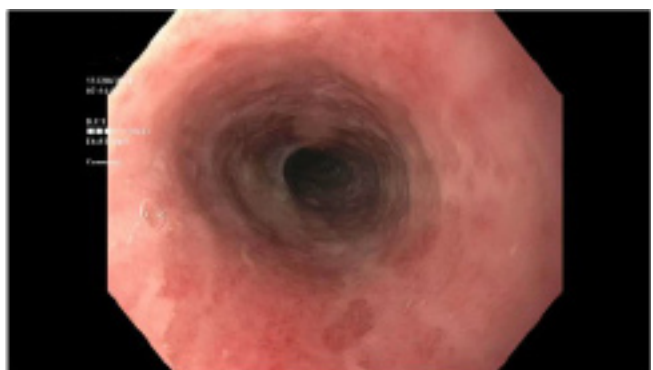
2. Middle third of esophagus