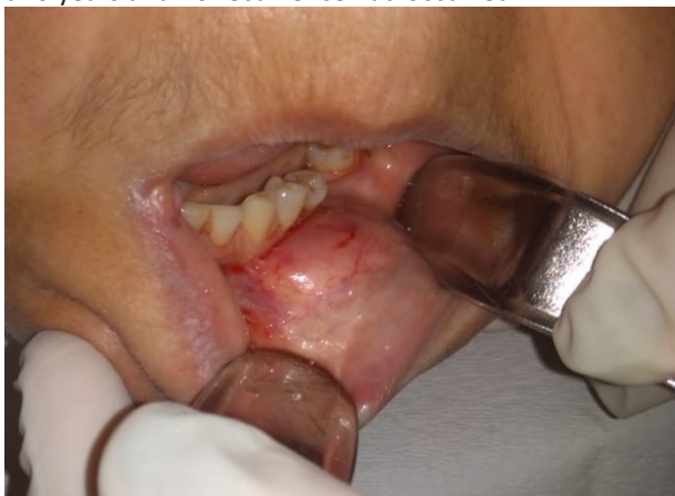
Figure 1: Large and painless mass of soft consistency in the left buccal mucosa, suggesting a lipoma. It was possible to delimit the area of the mass with the fingers of the examiner.

After the surgery, the patient was prescribed with 500 mg of Amoxycillin for seven days, and 600 mg of Ibuprofen and 500 mg of Acetaminophen for 4-5 days. The patient was followed up for two years and no recurrence had occurred.