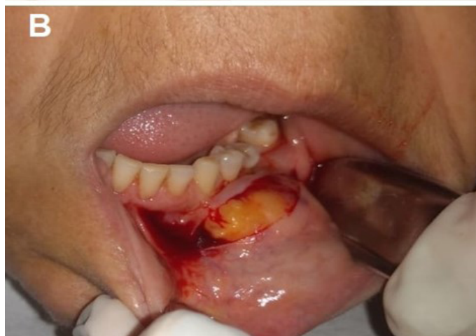
Figure 2: Surgical technique. (A) Slightly curved incision on the mucosal plane over the mass, and a few millimeters beyond (continuous white line). (B) After the incision, it is possible to see the yellowish substance of the tumor.