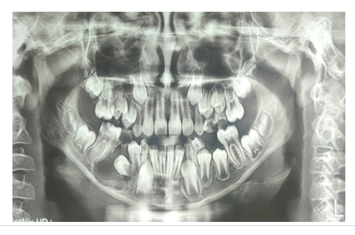
Figure 1: The panoramic radiograph: An incidental finding of a large , well-defined ,radiolucent lesion in the right mandibular body region.

During the intraoral examination, it was observed that the patient presented with multiple decayed teeth, indicating an early mixed dentition stage in dental development. A panoramic radiograph, initially conducted for oral cavity sanitation, incidentally revealed a substantial, well-defined, radiolucent lesion in the right mandibular body region. The lesion involves the permanent mandibular right second premolar, with its crown positioned horizontally, along with the roots of the decayed primary right second molar (Figure 1).