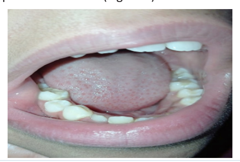
Figure 6: one-year follow-up clinical view: spontaneous eruption of the tooth.

After one year, Clinical inspection revealed a gradual spontaneous eruption of the tooth (Figure 6).