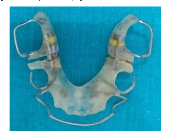
Figure 5: The removable space regainer.

The patient's mother received detailed postsurgical instructions, which included irrigating the cavity with chlorhexidine three times daily. Once the extraction site had healed, impressions of the patient's upper and lower arches were taken. Subsequently, a removable space regainer was crafted to straighten the axis of the permanent mandibular right first molar and create adequate space for the eruption of the permanent mandibular right second premolar (Figure 5).