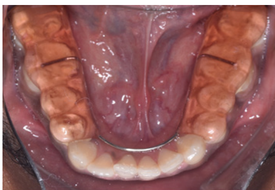
Figure 2: Represents light cure composite for disocclusion in cross bite or deep bite correction. Occlusion was balanced on either side using an articulating paper of 8 micron thick.