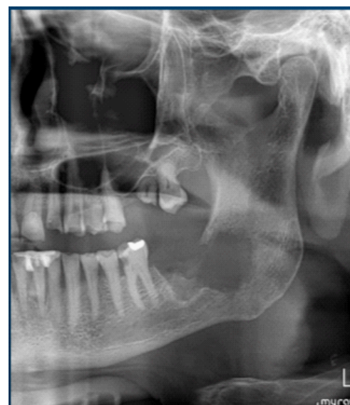
Figure 2: OPT after surgery.