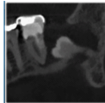
Figure 1: Element 3.7 with bone resorption. Considerable loss of both lingual and vestibular cortical walls.

A radiological investigation was subsequently requested three-dimensional by means of volumetric CT from which it was possible to appreciate an associated diffuse bone resorption to a considerable loss of both lingual and vestibular cortical walls. Subsequently, the extraction of elements 3.7 and 3.8 was planned and performed and at the same time a biopsy of the lesion was performed. The histological report revealed squamous cell carcinoma primary intraosseous developed from the lining epithelium of an odontogenic cyst. MRI with contrast medium was performed immediately after surgery which revealed a primitive neof ormation localized in the proximal third of the left mandibular branch, lytic expansive, infiltrating the distal end of the masseter muscle, the medial pterygoid muscle and marginally also the distal mandibular insertion of the ipsilateral mylohyoid muscle. There were also multiple lymph node swellings at levels I-II (a-b). The patient underwent segmental mandibulectomy associated with complete latero-cervical emptying followed by plastic reconstruction by means of a fibula and radial flap. During the surgical procedure it was not possible to use the fibula flap, due to removal, during the operation, also of the mandibular condyle.