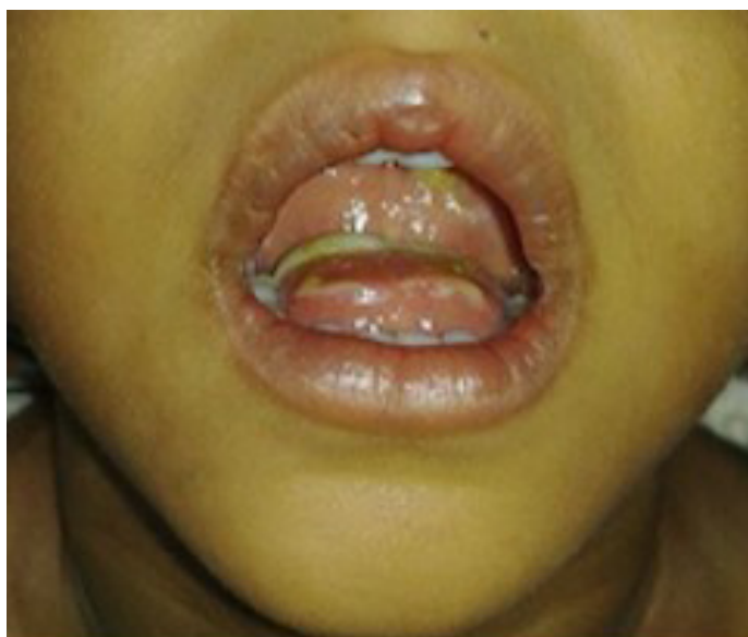
Table 1: Soft Palate Abutting the Tongue.

On examination, child was tachypneic (respiratory rate 35 breaths/min) with 98% saturation on oxygen by facemask @5L/min in sitting position. Further clinical examination revealed running nose, nasal flaring, chest retractions, use of accessory muscles of respiration, and bilateral wheeze along with mild inspiratory stridor. Airway examination revealed bulging soft palate abutting tongue, the posterior pharyngeal wall could not be seen (Figure1). Discussion with ENT surgeon revealed mass was not present inside the oral cavity, it was arising from nasopharynx and was not fragile as examined through tongue depressor and anterior rhinoscopy. Computed Tomographic (CT) scan suggested homogenous soft tissue lesion in the region of posterior pharynx and adenoid measuring 830×34×30 mm obliterating nasopharynx, extending to posterior nares and concha more on the right side and causing bulge of the pharyngeal wall and soft palate (Figure 2).