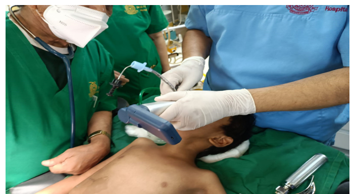
Child Video Laryngoscope