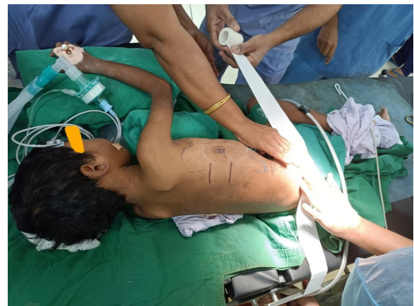
Final Position of Child

For post operative pain management epidural catheter was placed on the right side at the surgical site between skin and muscle and a test dose with 0.25% bupivacaine was given, adequate analgesia achieved and erector spine block was given on left side for post operative pain management.